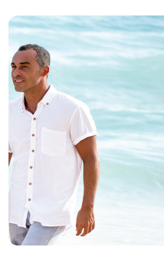
TRAVEL BASIC TRAVEL PROTECTION PLAN POLICY